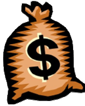
Show us the money.

like Sears. If you join the free KidVantage plan, Sears will replace any item that wears out before your kid outgrows it.