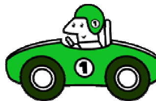
"MOM, I'M GONNA BE SICK!"

front window and concentrate on objects at a distance.